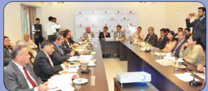
AICADR Meeting with SAARC Arbitration Council and Bahrain Chamber of Commerce & Industry Delegation