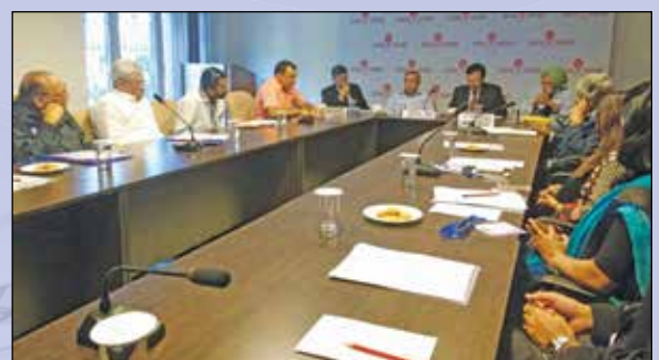
ADR Council meeting in progress