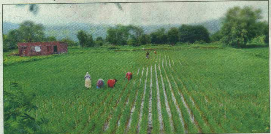
The study also pointed out that the state has recorded poor crop productivity owing to a "sandy soil quality"