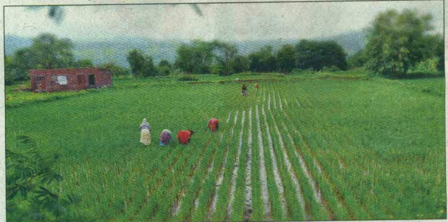
The study also pointed out that the state has recorded poor crop productivity owing to a "sandy soil quality"