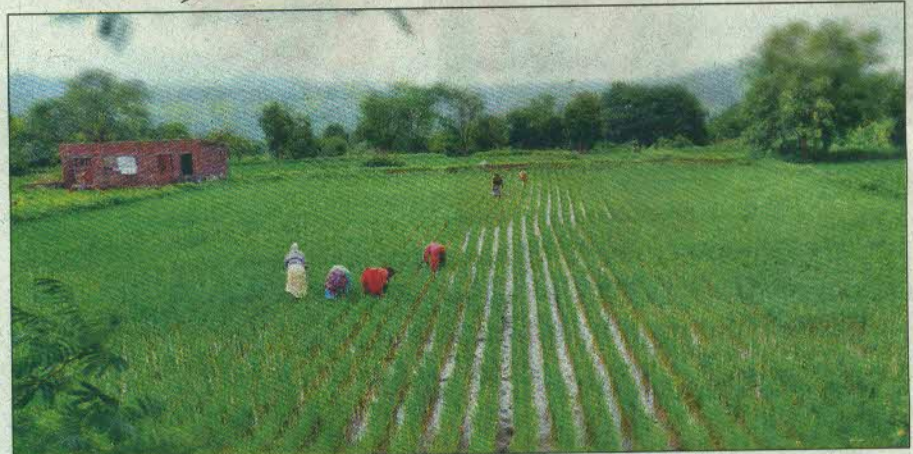
The study also pointed out that the state has recorded poor crop productivity owing to a "sandy soil quality"