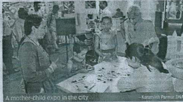
A mother-child expo in the city

The random survey, conducted by Assocham Social Development Foundation, finds that over 500 respondents do not want to have second child, while many say that they hesitate in order not to jeop-