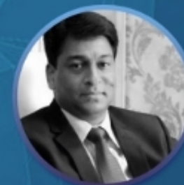
CA Bimal Jain Renowned GST & e-Invoicing expert